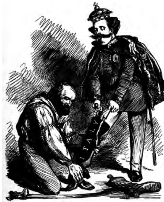
RIGHT LEG IN THE BOOT AT LAST.

"IF IT WON'T GO ON, SIRE, TRY A LITTLE MORE POWDER."