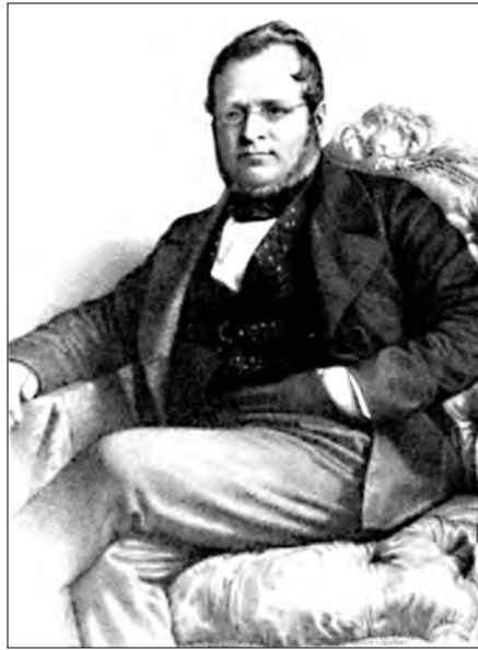
A painting of Cavour.

The greater the danger the more clear and calm he became, and the more correct his judgement. He always had supreme confidence in himself and thus he was reluctant to ask advice from others.